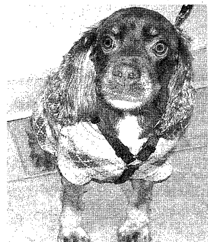
Lady from Second Chance