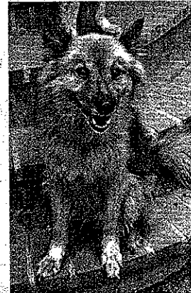
Trixie From Second Chance barksinc.com or call 973-300-3185.

For more information on Dylan, and BARKS, visit www.