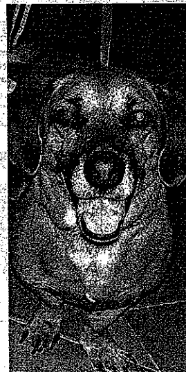
Princess From Second Chance

Trixie is a gorgeous and fluffy senior collie/shepherd/spitz/chow surrendered to a local shelter because the grandchildren were allergic. She is a happy, friendly dog who loves everyone, is housebroken and good with cats. She deserves a home that will appreciate all of the love and devotion that she has to offer in her golden years.