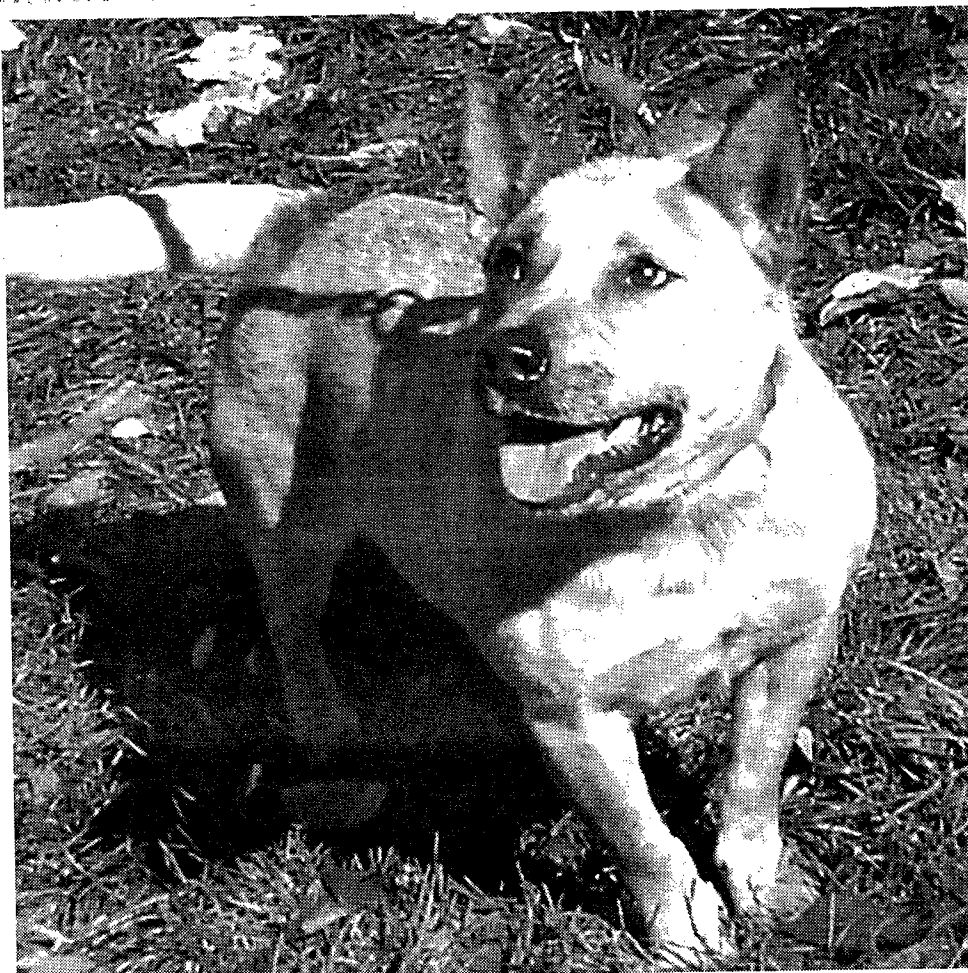
Snuggles from Noah's Ark