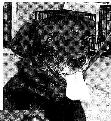
▲ Clyde ◀ Tucker

Another dog in need of a home is Clyde , an older black lab. He is very friendly and loving. Clyde can't be taken on long walks, but