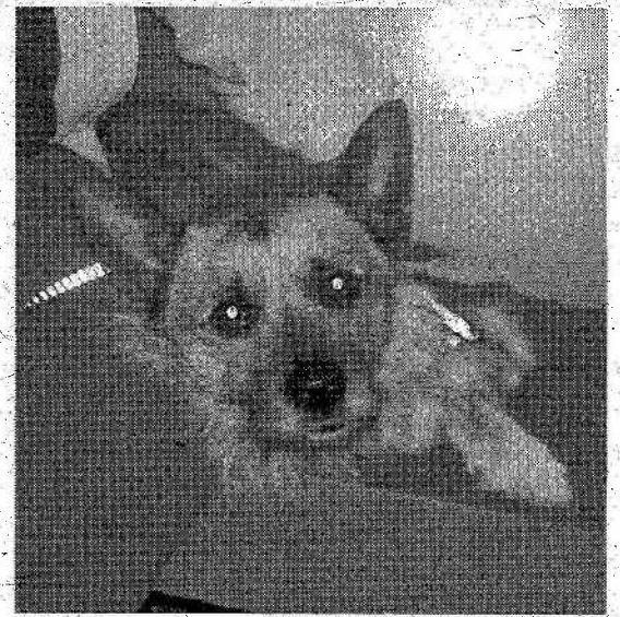
Ziggy from Second Chance

CLAWS Cat Rescue and Adoption Shelter of Sussex, Inc. is an Augusta-based shelter. Two of their cats in need of a loving home are Floyd and Charlie. They are brothers and were abandoned in a dumpster as kittens. Floyd and Charlie were found by a store owner who took care of them for six years. Unfortunately, the owner was no longer able to care for them and donated them to CLAWS. Both boys are extremely sweet and lovable, up-to-date on shots and neutered. Since they have been together since birth, CLAWS would prefer to find them a home together. For more information on Floyd, Charlie, and CLAWS, visit clawsnj.9f.com or call 973-875-8540.