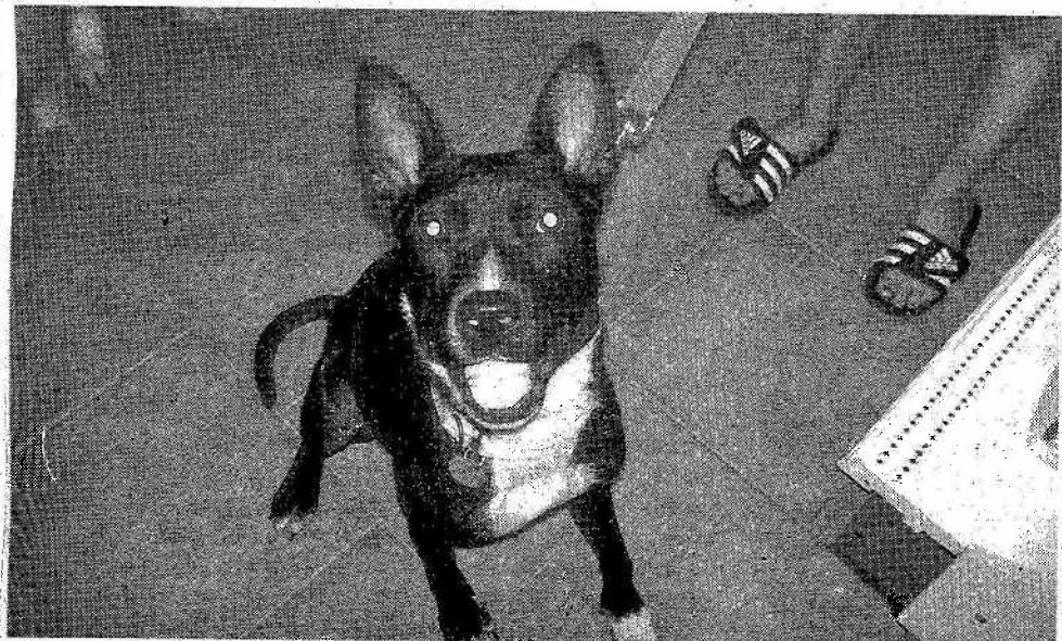
Zia from Second Chance

Oak Ridge-based rescue for dogs. One of these dogs is Ziggy, an adorable 3-year-old Cairn/Norwich terrier mix who was rescued from death row at a local pound. He is housebroken, calm, and well-mannered. Ziggy is looking for a calmer adult home where he can be the only pet. He will be a loyal, protective companion to his new owner.