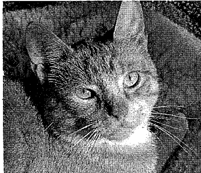
▲ Cloud from Noah's Ark and Winter from BARKS