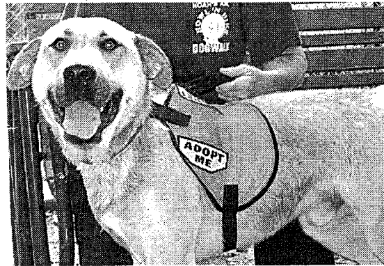
▼ Rocky from Noah's Ark